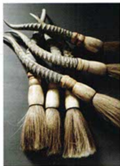
This page The cabin is decorated with a quirky selection of items, including cushions and earthenware dishes from Borgo delle Tovaglie, vintage candleholders and Tibetan paintbrushes Opposite All of the furniture in the dining room was designed by the homeowner Stockist details on p213 ►