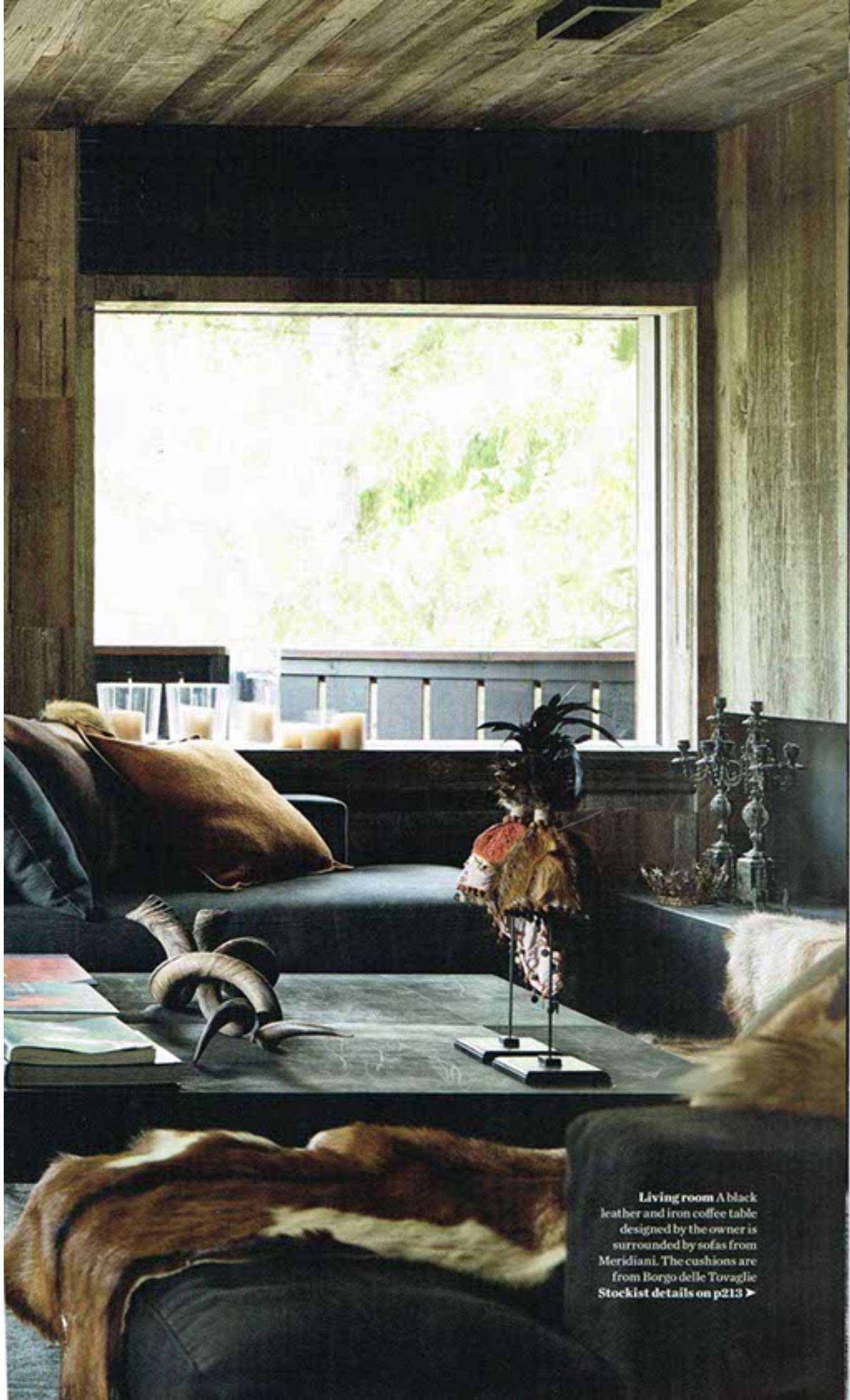
Living room A black leather and iron coffee table designed by the owner is surrounded by sofas from Meridiani. The cushions are from Borgo delle Tovaglie Stockist details on p213 ▶